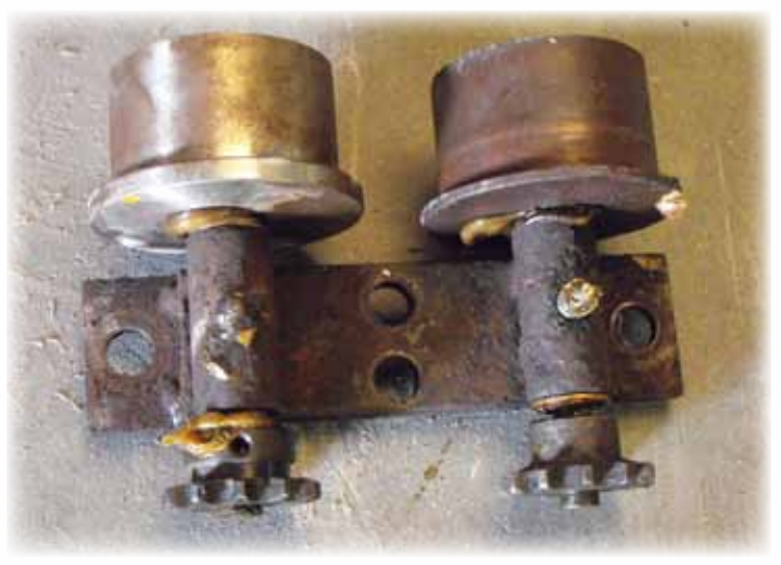
Rebuilt bushing, note the gold-colored Almaplex 1299 lubricant